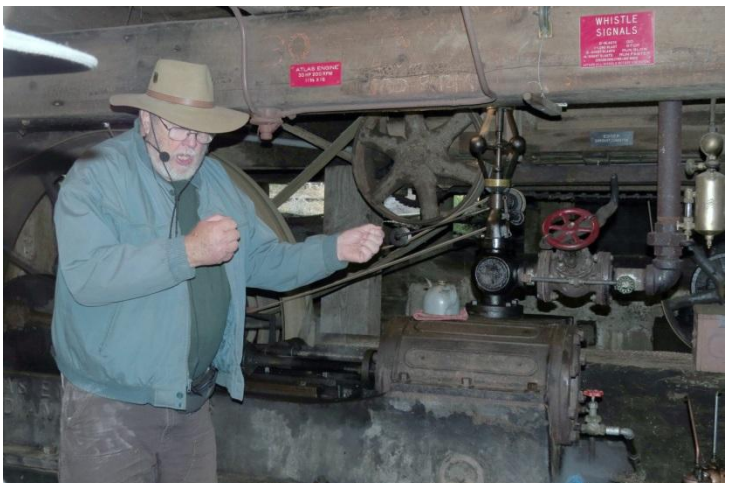
Our docent explaining the workings of the Atlas 30HP 200 RPM engine that drove the carriage....that's the widget that moves the logs through the saw blades......