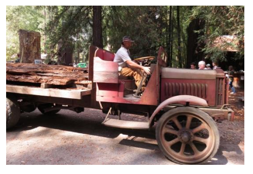
This is a 1924 Dorris. There are only five remaining in the world, and this specimen is the only one still running!