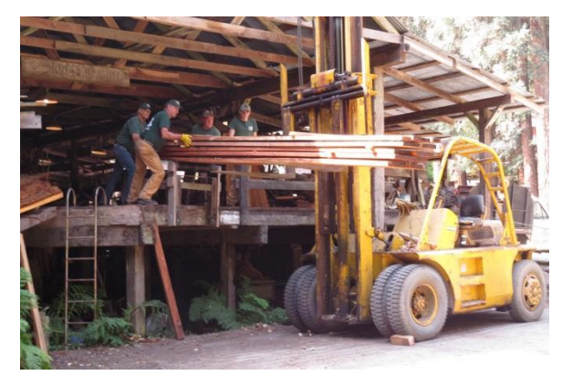
Left to right: the authors' rather feeble attempt to photograph a rapidly spinning saw blade in poor light...but you get the idea; the smoother/planer that refined the boards after they came off the carriage; and the finished product being loaded onto a forklift for distribution.