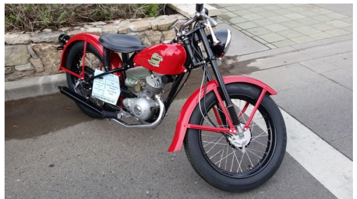
Small Harley from 40's