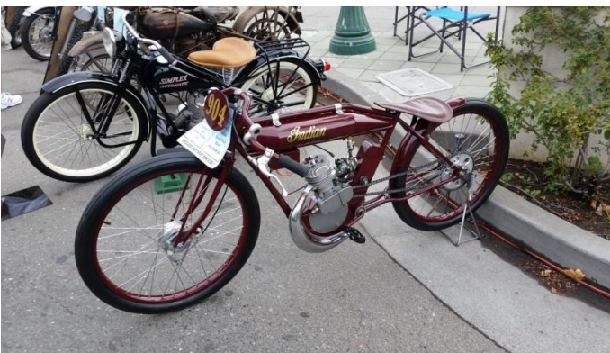
Indian Board track Racer Replica