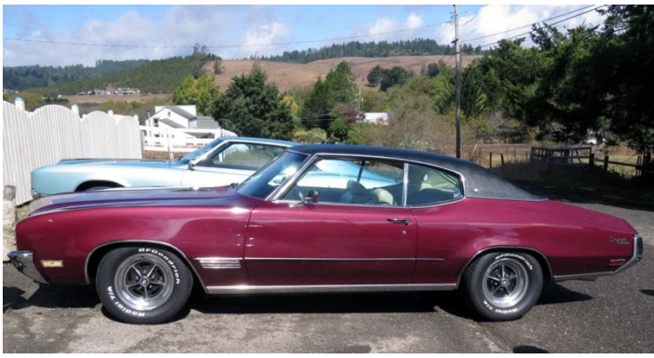
More Bodega School House: