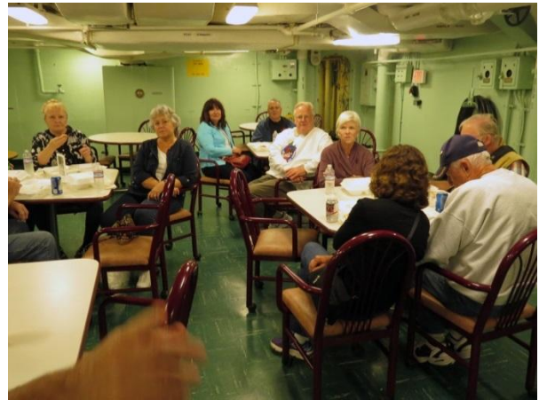
Lunch in the Chief Petty offer's Mess