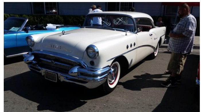
'55 Buick Special