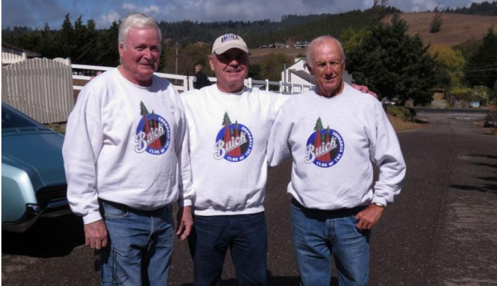
Los Tres Amigos