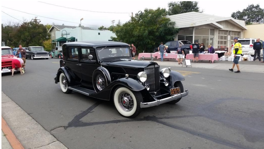
Best of Show - Packard