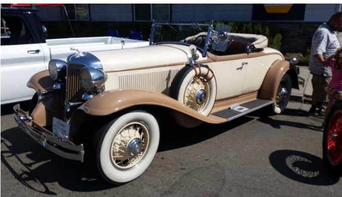
1929 Crystler Rodster