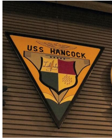
This reporter's ship (1970's)