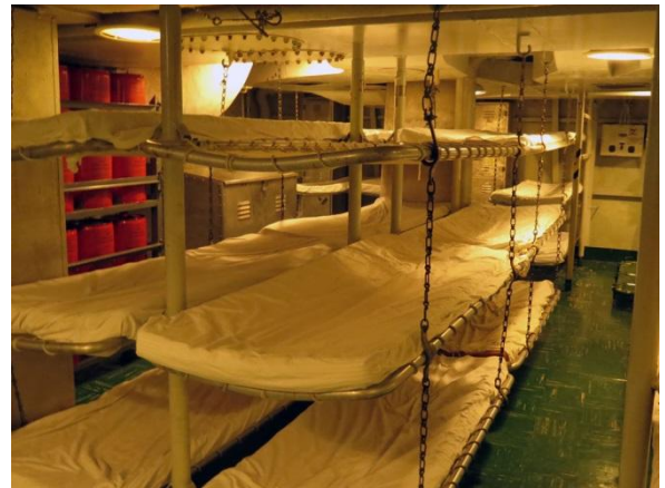
Enlisted....need I say more?

We went below decks to visit the officers and enlisted berthing areas: