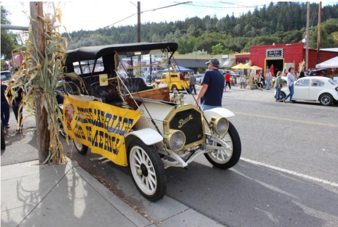
Brass Era Buick