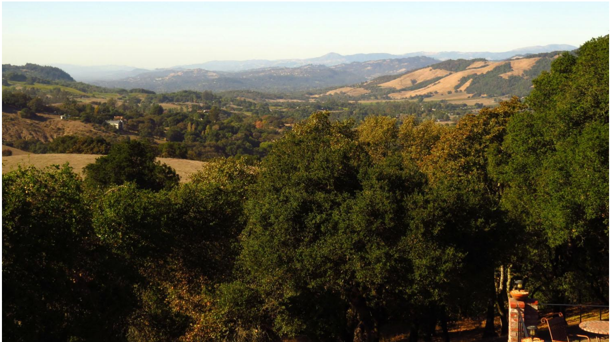
The north-looking view from the deck