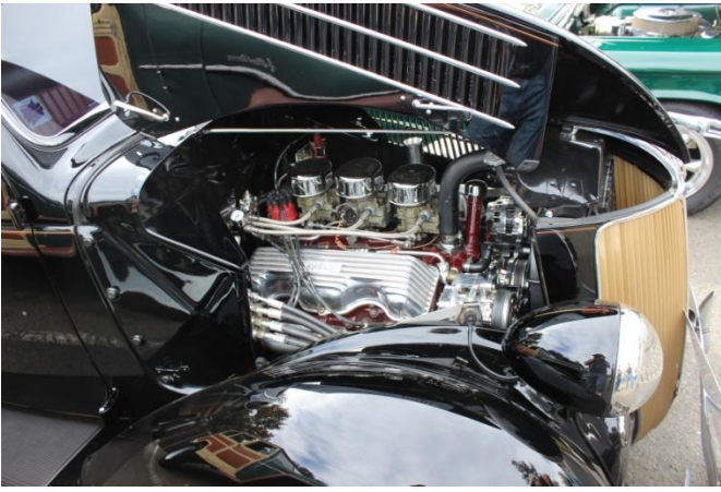
Bob G's '36 Coupe 348 Engine