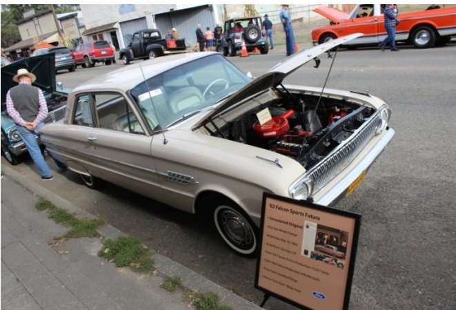
'62 Ford Falcon-sign says "all original"