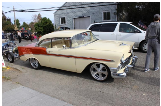
'56 Chevy "nice"