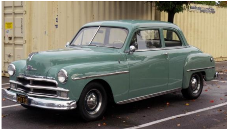
Gail and Stan's '51 Plymouth

Only three members braved the threatening weather and brought their Classics....Bravo!