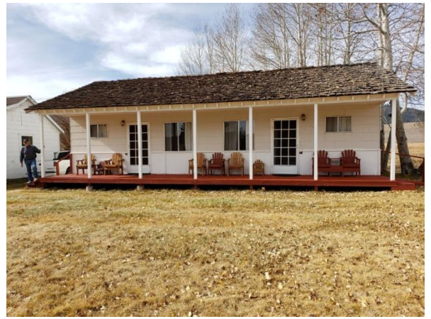
Welcome to Hunewill Ranch, in the family since the 1860's. Doesn't look like much but about all we did there was eat breakfast and dinner and sleep!