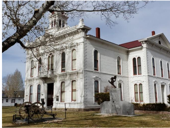
Beautiful Mono Country Courthouse in Bridgeport. Italianate architecture built in 1880.

We drove down a day early to take off the pressure of arrival time. About a 5 hour drive.