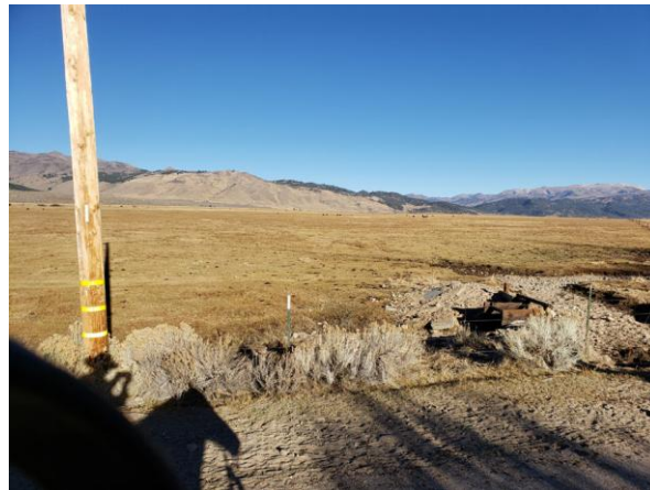
Up early! Ugh! Wake up bell, 0545. Bill and I are up at 0515. Departing the ranch early to gather the cattle in the pasture prior to crossing US 395 with the help of the CHP. 28 F just after sunrise. Found out right away the problematic body parts. Hands and feet!