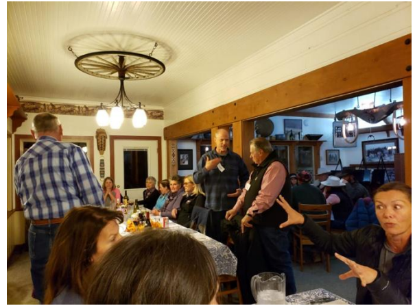
First night dinner in the ranch house. Compared to 2 years ago the food was much improved, new cook! Everyone getting pumped up for heifer and horse hogwash stories. The first storyteller doesn't have a chance.