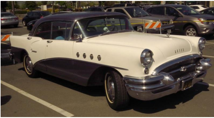
Gary's 55 Century