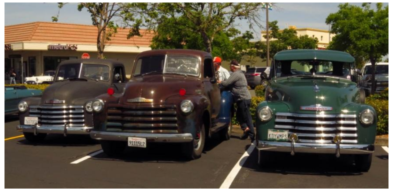
I brought my '53 Chevy and parked it where it could make friends