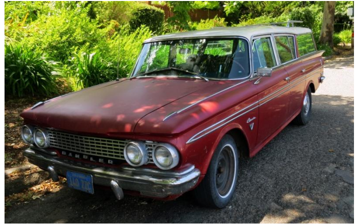
A Rambler --- Really ???