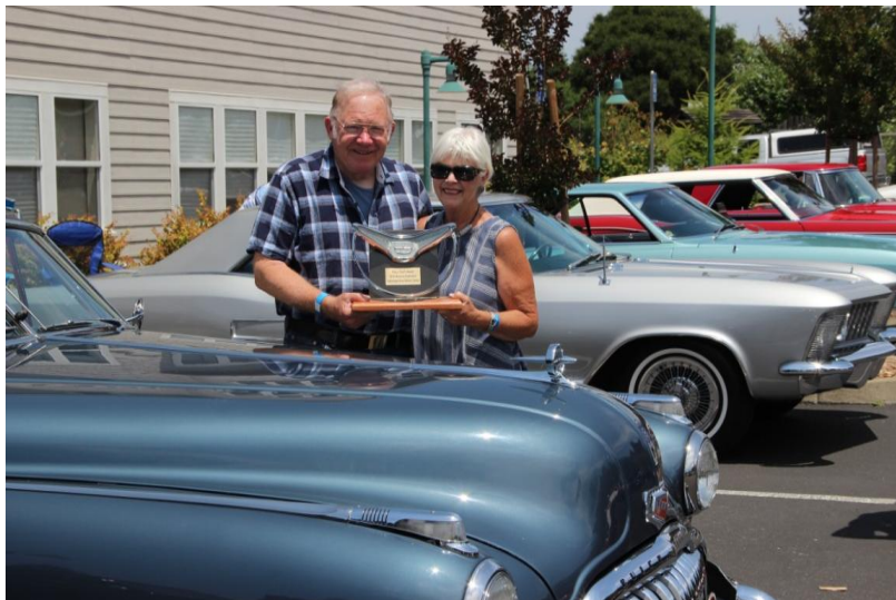
An Another Club Member brings home an award