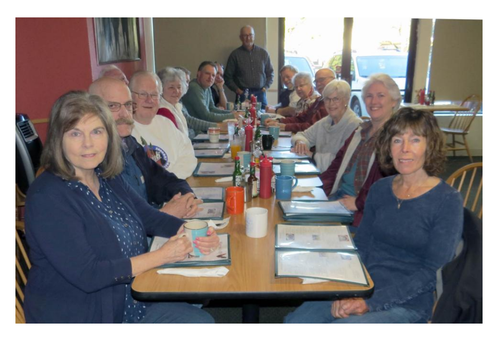
Our smiling group...well, mostly everyone was smiling!