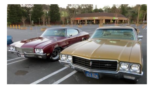
Our ladies looking good and ready to roll!