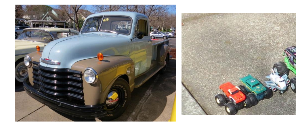
A rare '53 Chevy one-ton