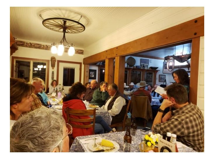
Farewell Dinner. It Became a Bit Emotional. One of the Wranglers Last Drive