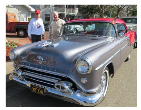
Bill's Super 88 Olds