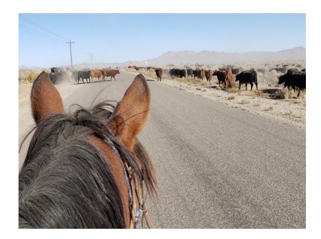
Big Al Watches the Front of the Herd