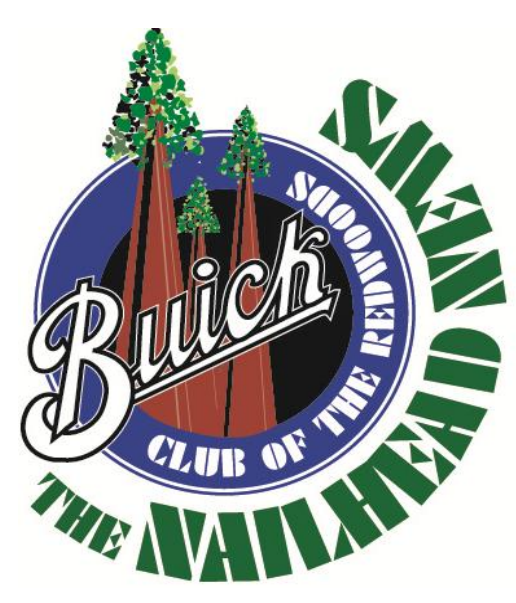
T-Shirts / Sweatshirts for sale.

We only have a few left of the white sweatshirts and t-shirts.