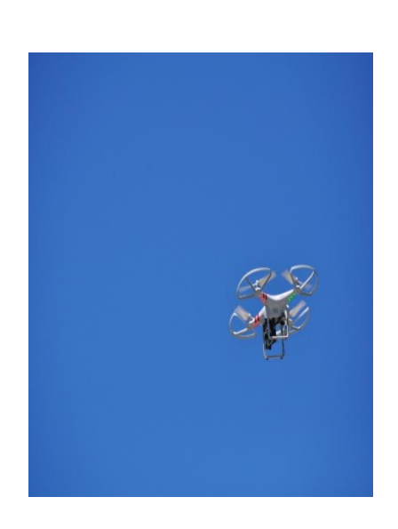
And we weren't alone ~:)

Always a great day to spend with good company – we all were home or close to home by 3:30 out of the heat.