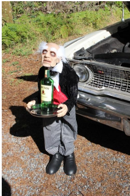
Is he one of us ??