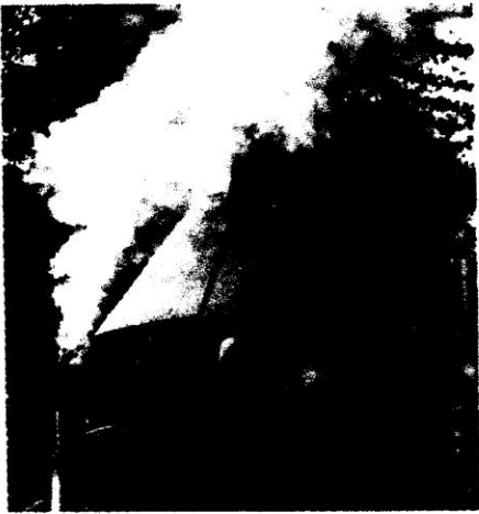
The resurrected "Steam Donkey"

Just down the way we have a local treasure of a working museum, The Sturgeon Steam Mill . It features ancient steam-driven machinery including the sawmill itself, the planer that hoots out giant smoke rings, and the newly resurrected huge "Steam Donkey". Experienced volunteers work in rhythm with these and you can embed the sounds and smells of one of our founding industries. It is both primal and detailed, full of historic and amusing info about local families and businesses, and an immersed steam-punk dream.