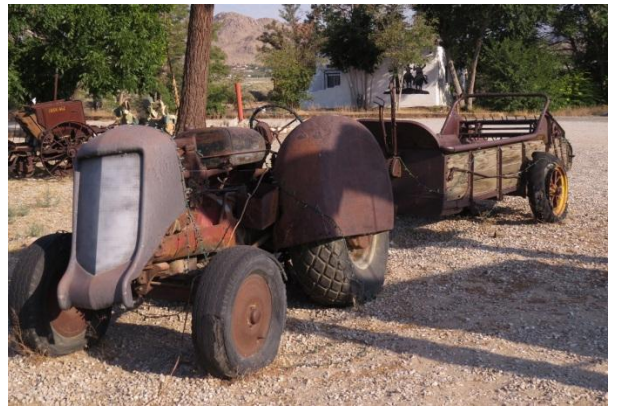
A couple of other goodies that caught my eye.....