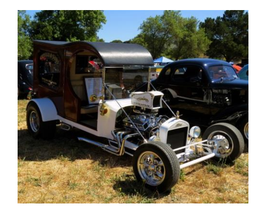
Kaddywampus Wanna Bee