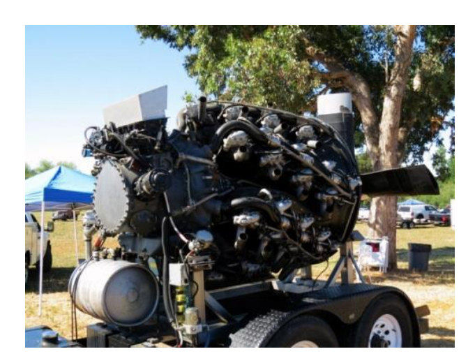
The Whitney Pratt Engine