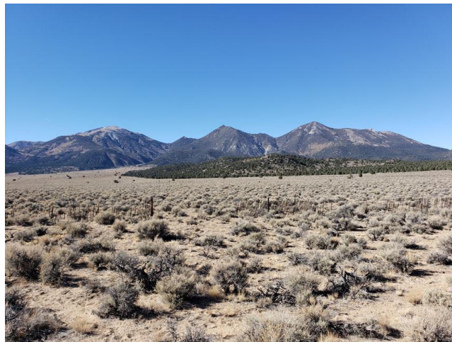
This view is the terrain we are headen' for. We will stay just right of the mountains of course