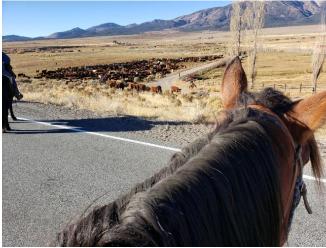
Mounted up and we are preparing to push the cattle up on to the road. That is Wild Bill extreme left.