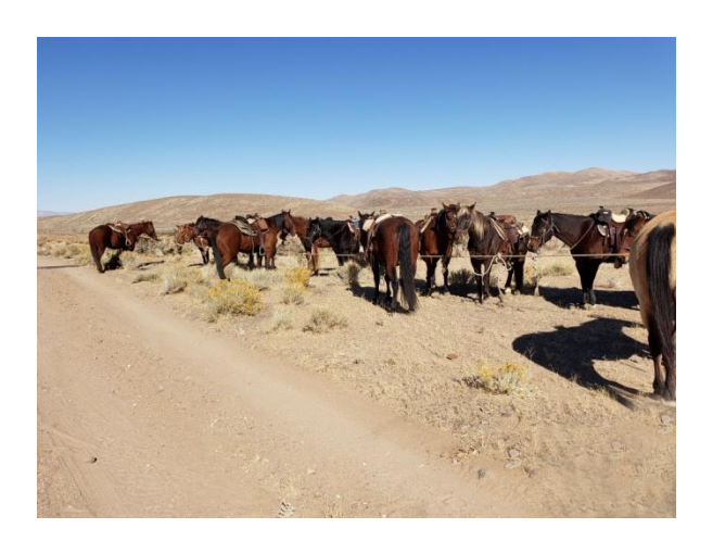
Lunch time at the Picket Line