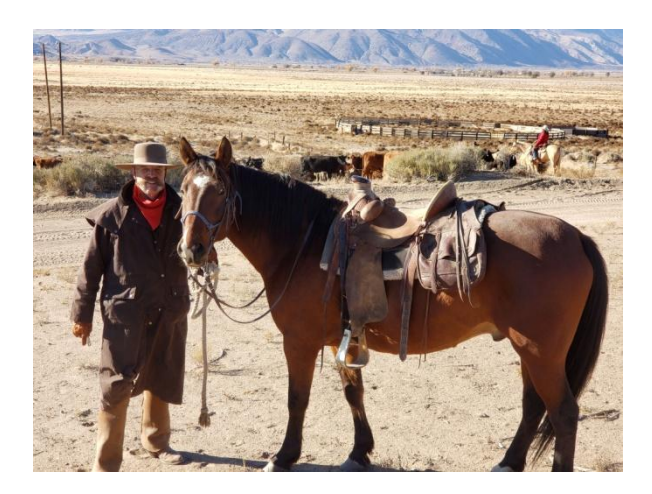
Time to Stretch Those Achin' Muscles....or a Rollin' Outhouse Break.