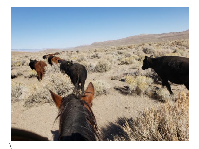
Back on the Trail

This day started out substantially colder at sunrise than yesterday; 9 F! It will get worse!