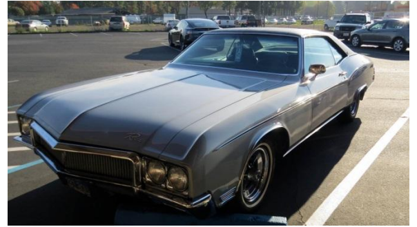
Four of our classics were in attendance.

We had a nice dinner and good conversation.....here are some random pictures taken during the dinner: