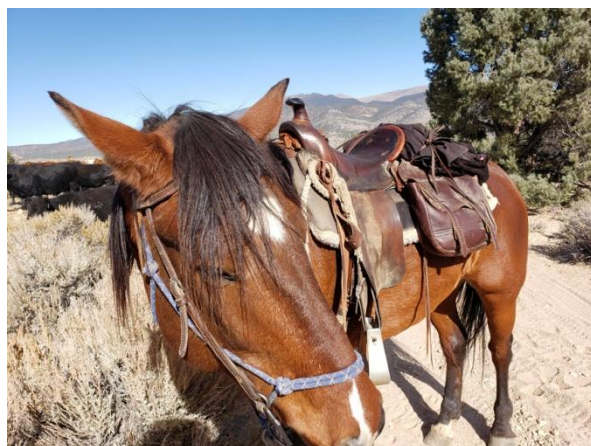
My Mount Alamo (AKA Big Al) Sunning. A Born in the Wild Mustang and a Real Handful From Time to Time