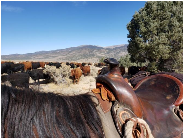
We Come Out of the Canyon Holding the Cattle Until They All Arrive. Lunch time!