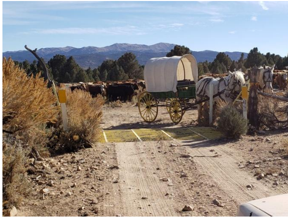
Chuck Wagon That Went Darn Near Everywhere We Went. Lunch Yonder to the Right