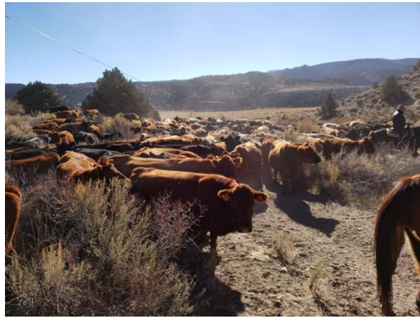
Bunching the heifers – Preparatory to moving them up the Canyon.