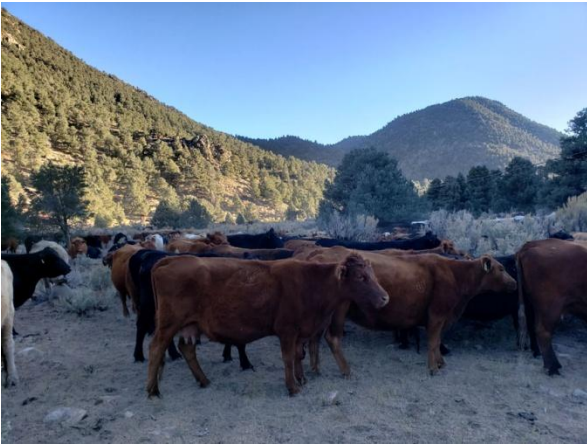
Cows Held Up for the Night