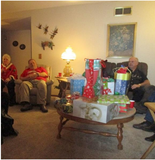
Anxious moments before the exchange started