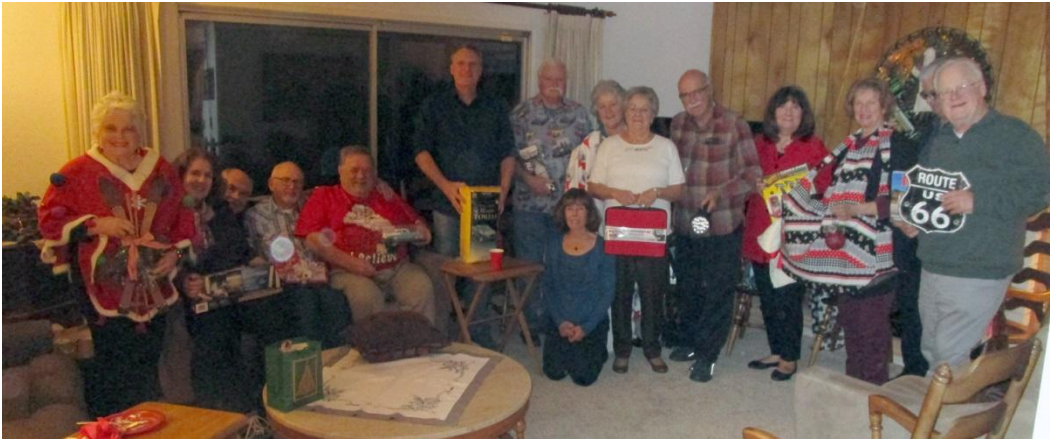
Lots of smiling faces with their gifts....only a moderate amount of stealing this year!