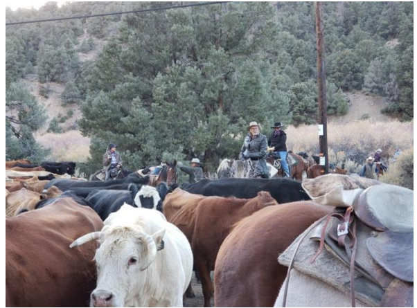
Wild Bill Watching Over the Heifers. 1 st day Riding Done! About 8 hours in the Saddle and Roughly 16 miles traveled