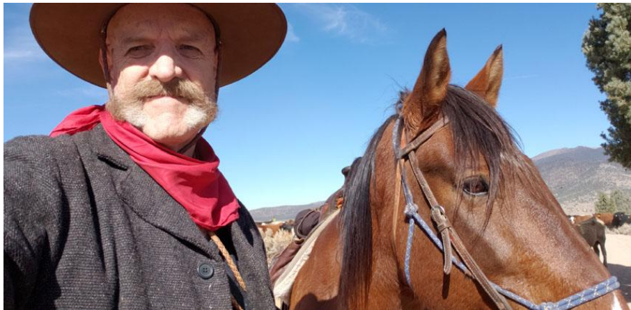
My First Ever Selfie...and Last!