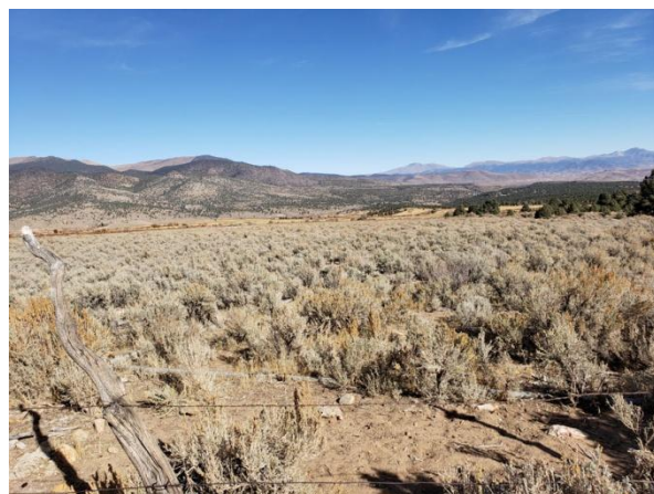
View From Where We Sat For Lunch. Heifers Right behind us