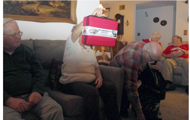
Adele scored a Roadside Emergency Kit