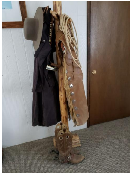
Tools of the Trade. Day 2 Complete, Short Day, 6 Hours in the Saddle. About 9 Miles Traveled ((but don't forget the gloves))