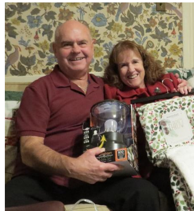
Aren't they just the cutest couple?!?