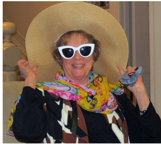
Donna, you do realize it's December and it's miserable outside, right?