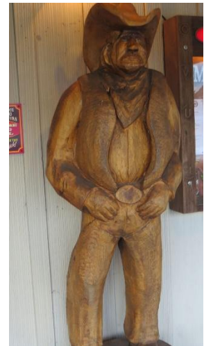
They were ready for us!