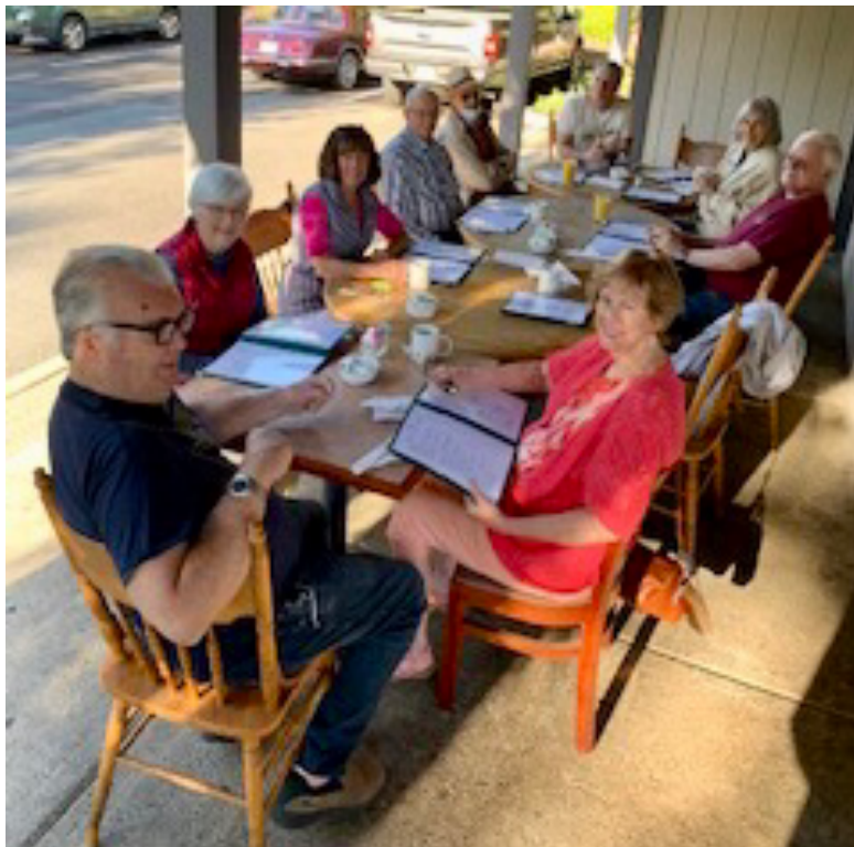
BCR Members enjoying Breakfast at Louie's Sept. 11, 2021