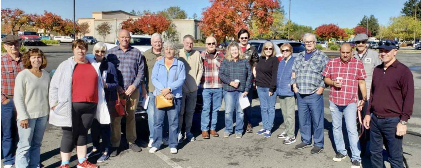
Our largest attendance of the season gathered in Rohnert Park