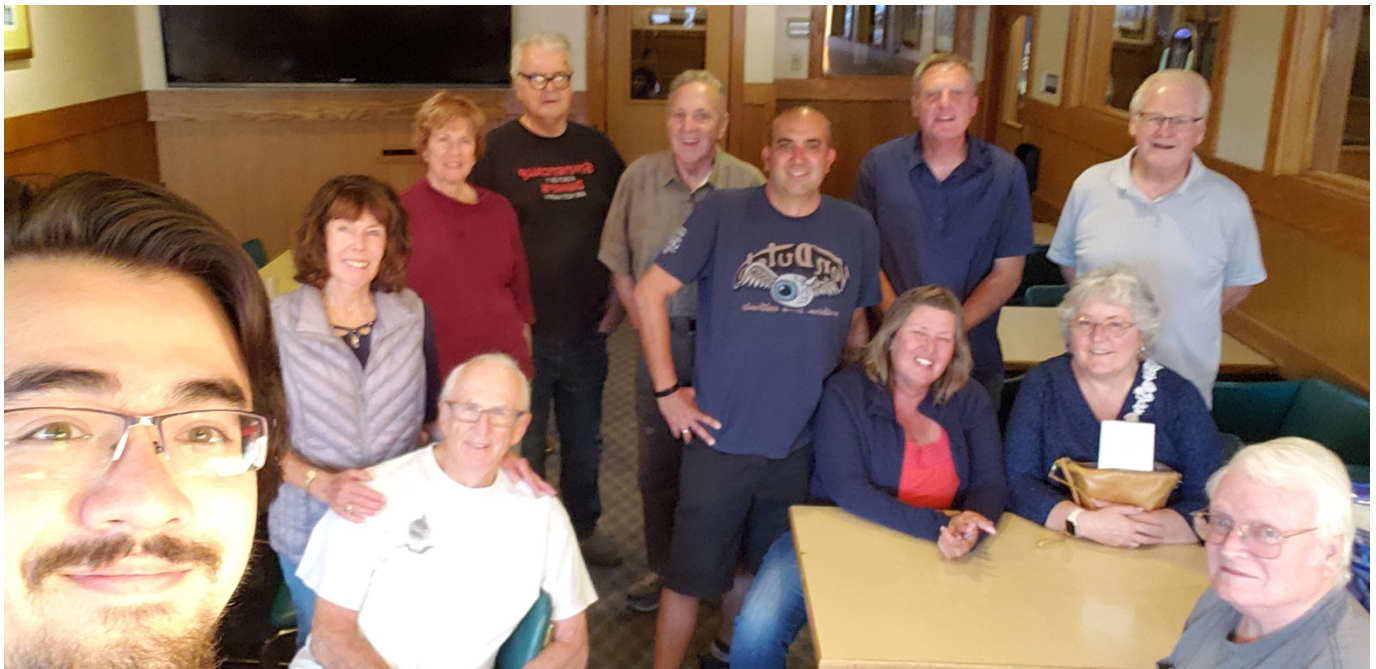
BCR Members enjoying our return to regular monthly meeting 7-14-21