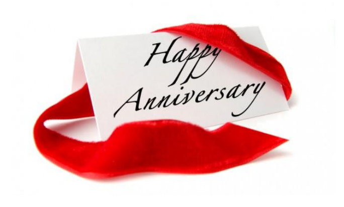
None to celebrateIn February