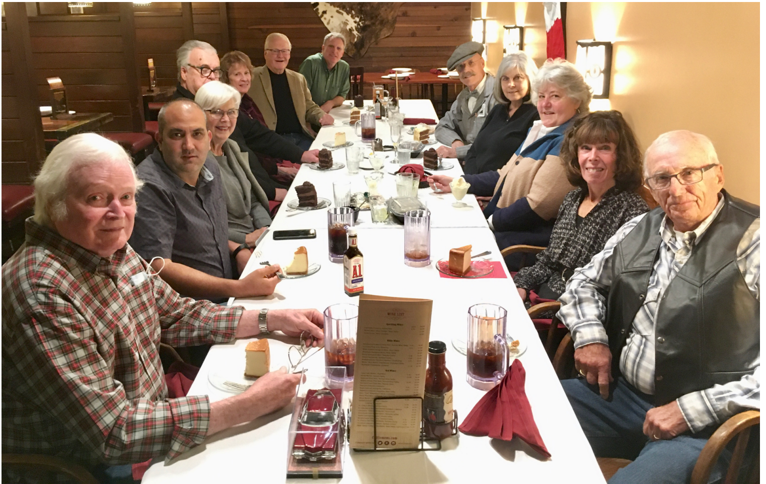
Our happy group