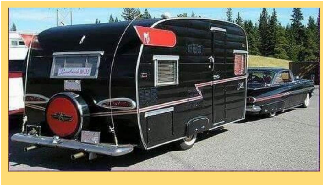
1959 Chevrolet Impala Hardtop with Shasta Travel Trailer