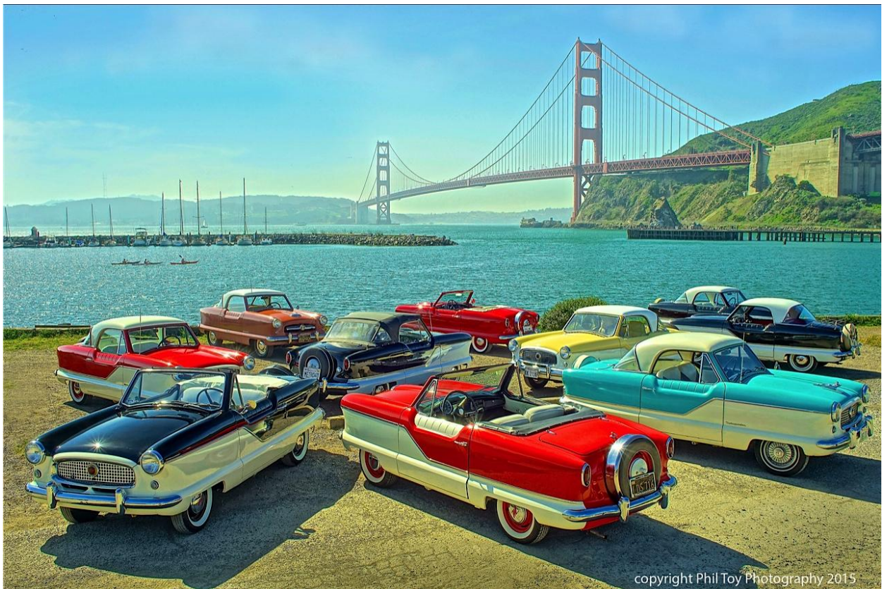
Metro Club professional Picture taken a few weeks back in San Francisco