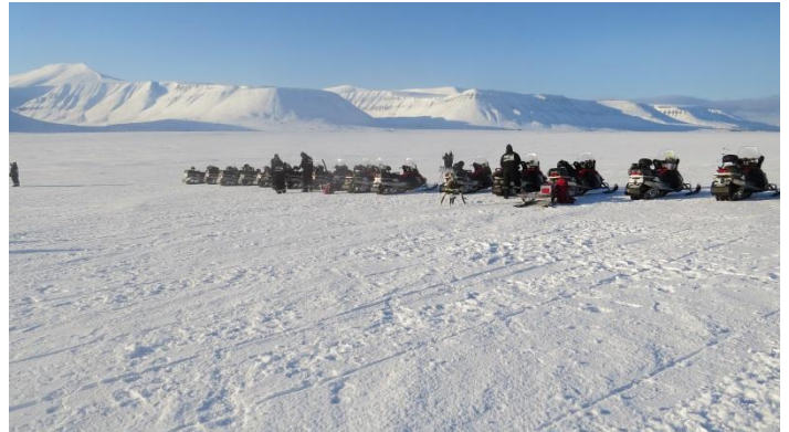
Eclipse viewing site with snowmobiles