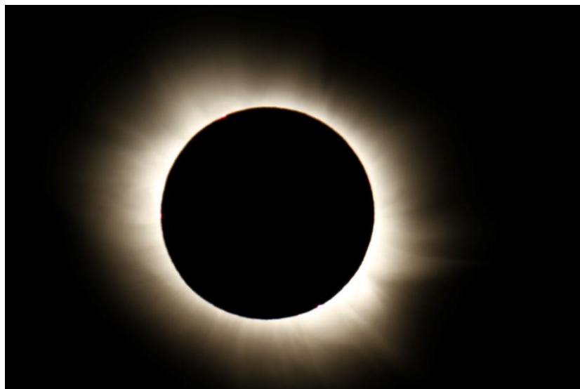
Totality with Corona