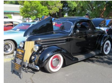
The usual suspects!