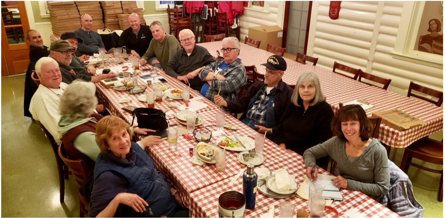
BCR Members enjoying the return of our regular monthly meeting.... catching up with many things Buick and future club activities.