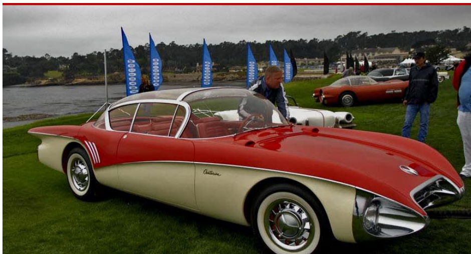
1956 Buick Centurion II