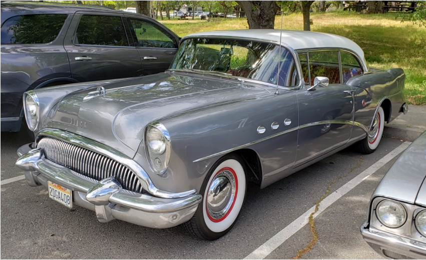
1954 Buick Special