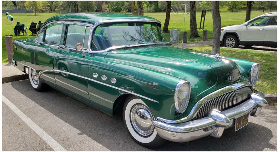
1954 Buick Super