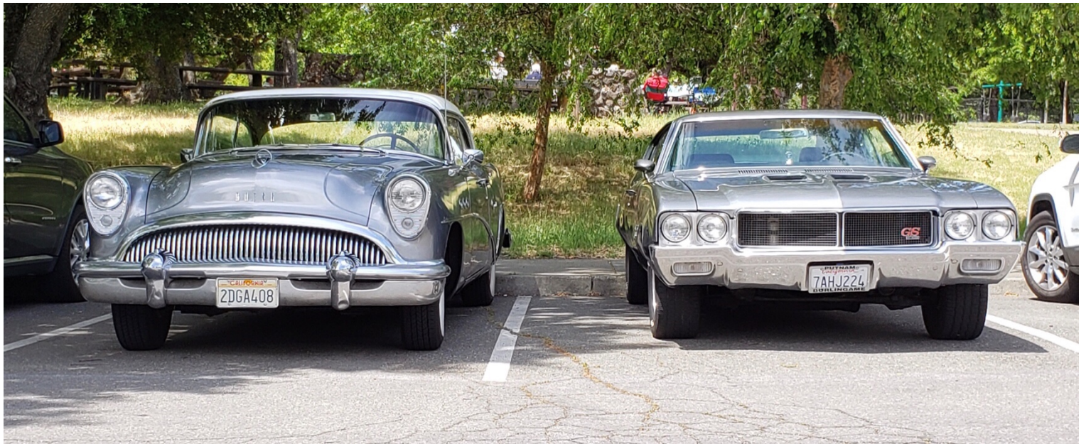
1954 Special and 1970 Skylark "GS"