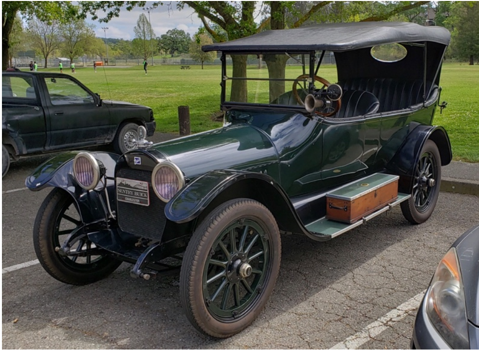
1917 Buick Touring Car