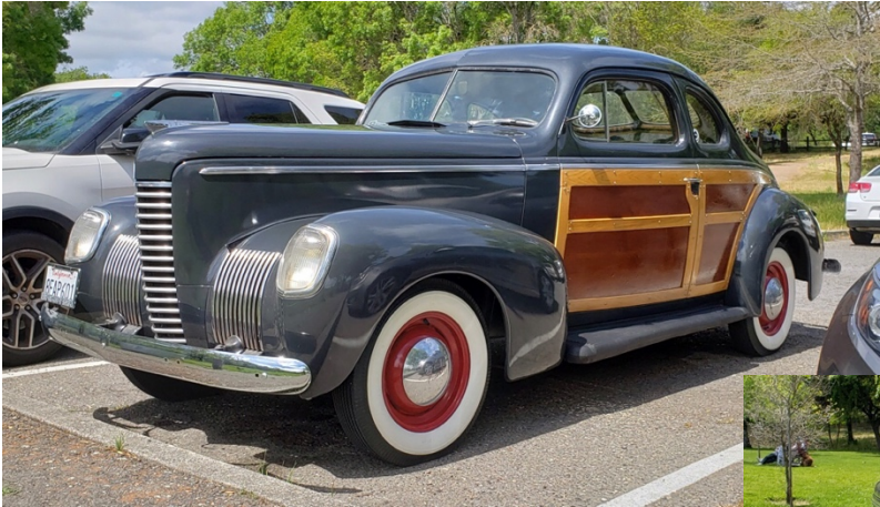
1939 Nash Business Coupe with custom fitted “woody” features