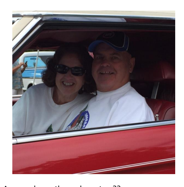
Any one know these characters??