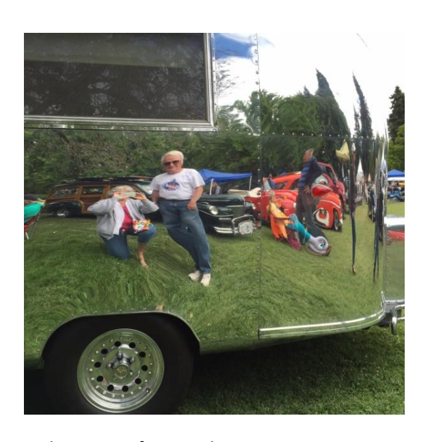
The magic of a very shiny \operatorname{\mathsf{Air}}\nolimits \operatorname{\mathsf{Stream}}\nolimits .