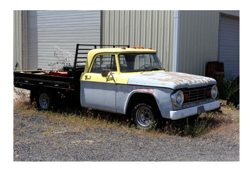
Saw this guy in Ephraim, Utah today.