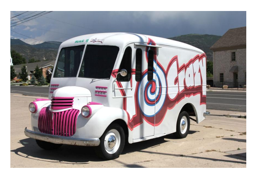
To be continued