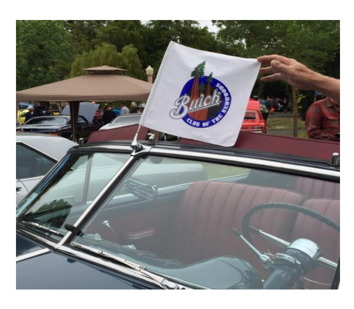
Any Interest in having another batch of BCR flags run?