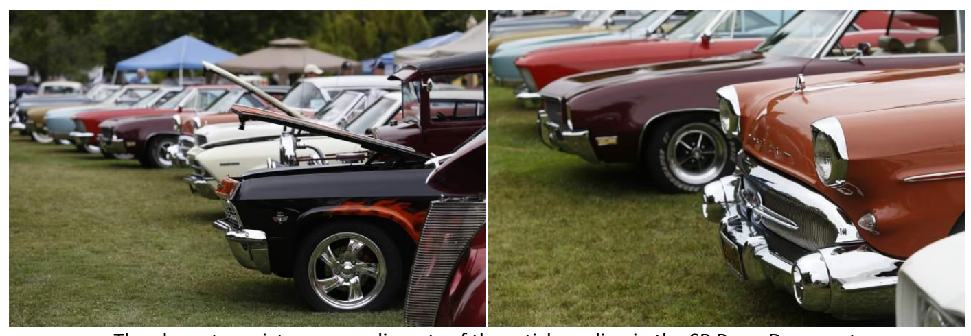
The above two pictures compliments of the article on line in the SR Press Democrat

Hope everyone in the club had an opportunity to sign the petition to continue at Juilliard park.