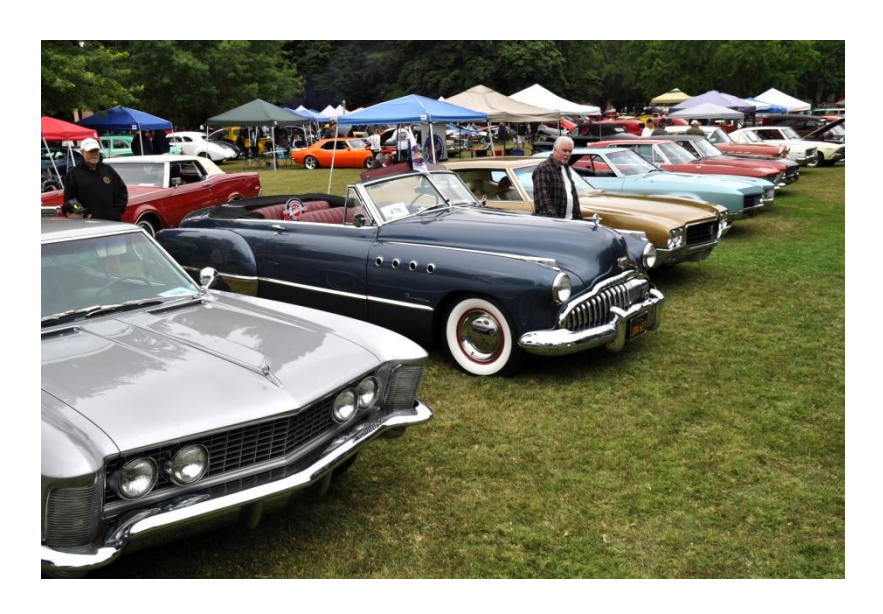
These pictures taken by Stan Sollid - who always has a good eye for great pictures.