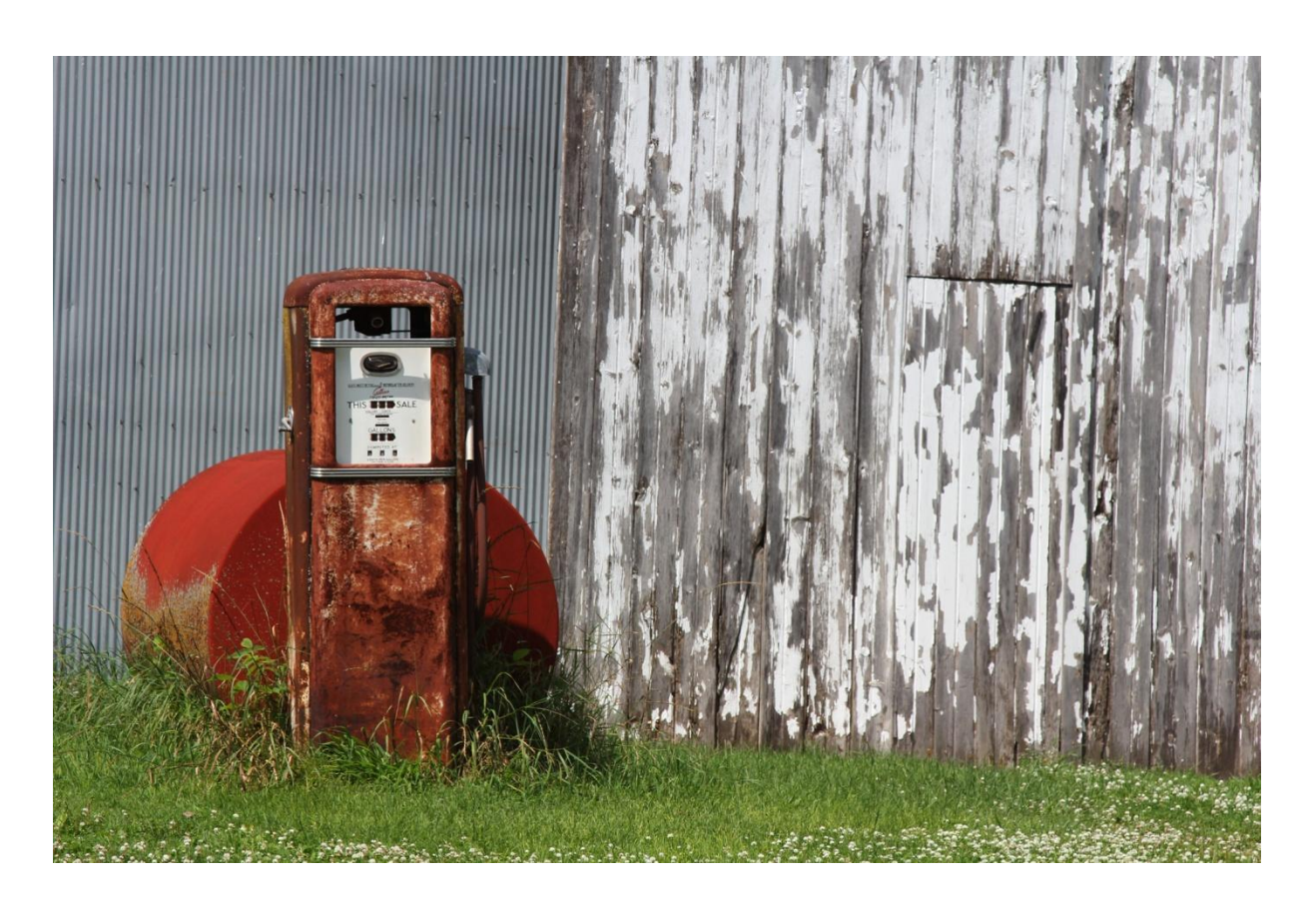
July 14th: Thought you might like this gas pump in Whitten, Iowa