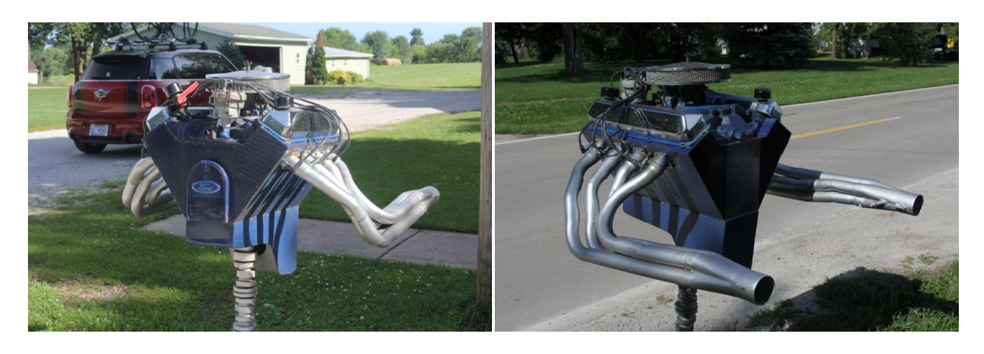
Humeston, Iowa (Mailbox)