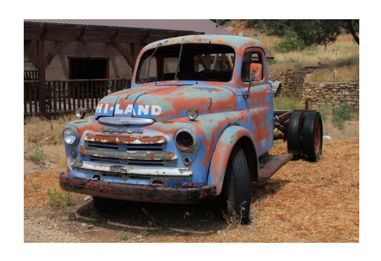
July 6, 2015 Pagosa Springs, Colorado