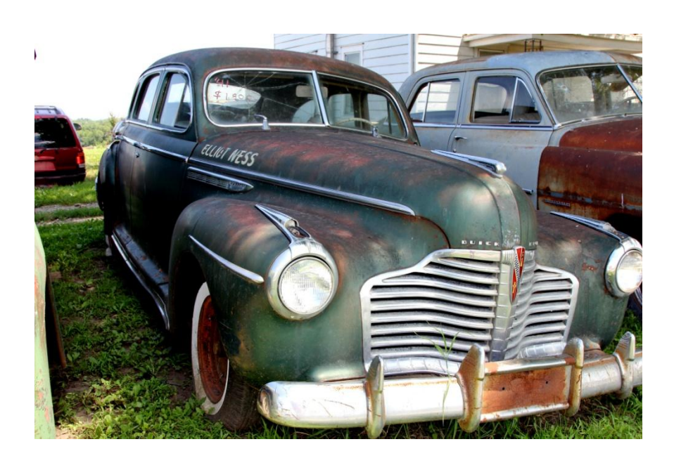
July 14: I was driving along today and saw this place right off the road in Pella, Iowa. There were at least 60 of these beauts there....here's a few samples.