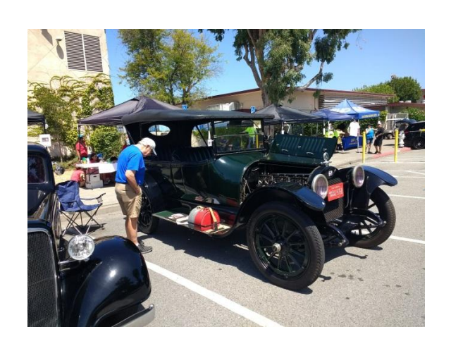
A 1917 Buick