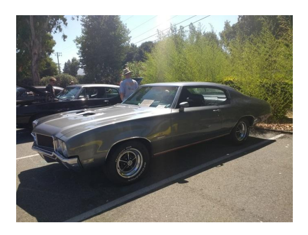
Andrew's '70 GS Stage 1