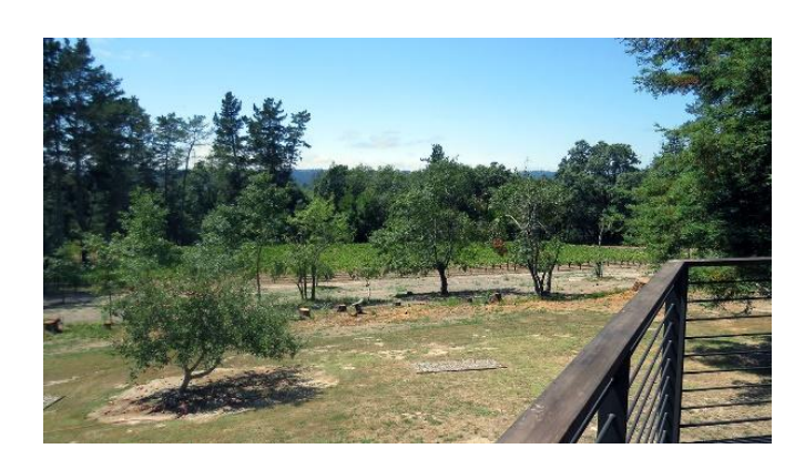
View to the South