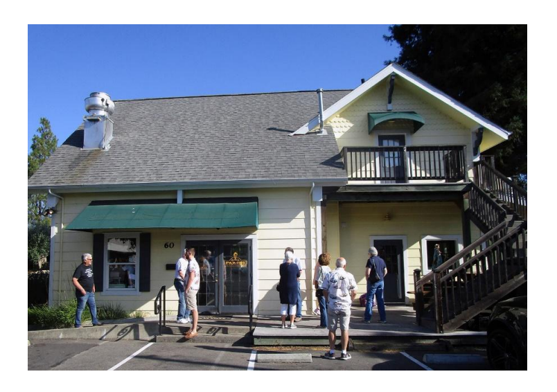
Good company, good conversation, and great New Orleans food!