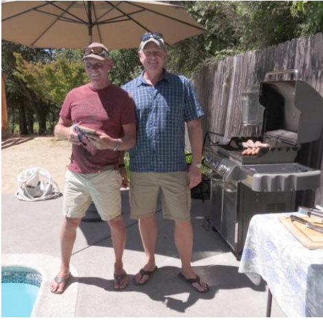
Our most gracious hosts