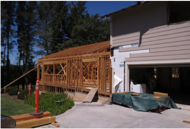
A major remodeling is going on....