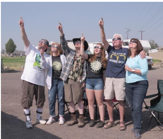
The Eggleston clan viewing the partial phases

The moon first crossed the surface of the sun at about 9:08 AM on the 21 st in Madras. During the 'partial phases' one must use eye protection to view the sun....you can watch totality with the naked eye.