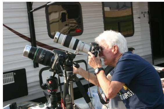
Getting my 'geek on' as my son-in-law was fond of saying...