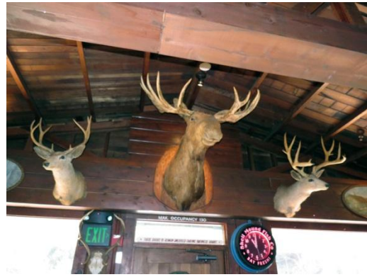
A few other pictures from Nick's Cove: