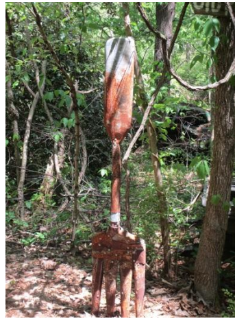
Fork in the Road