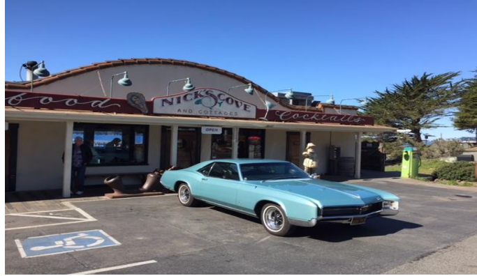
Nicks Cove Feb 27, 2018

April Showers bring May flowers. Everyone has to agree we have had some awesome spring weather these last few weeks. It has been great weather for a ride in the old Buick.