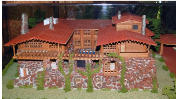
Model of the Wolf House