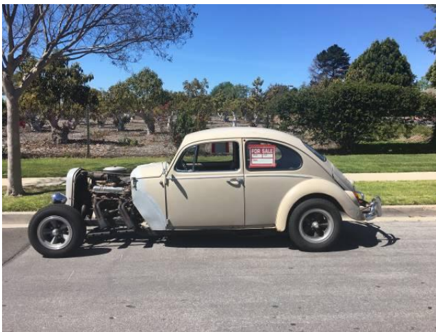
This ones for Terry - VW with a Nailhead